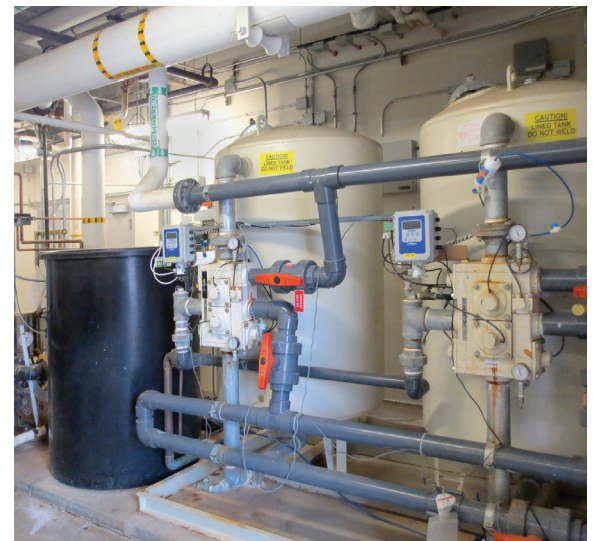
Indian Health Services, Winnebago, NE • Central utility plant conversion study