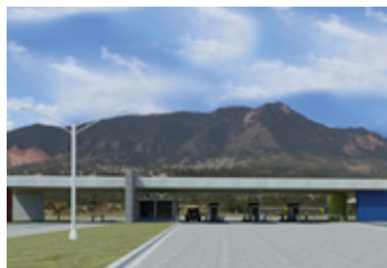
US Air Force Academy, Colorado Springs, CO • New entrance gate