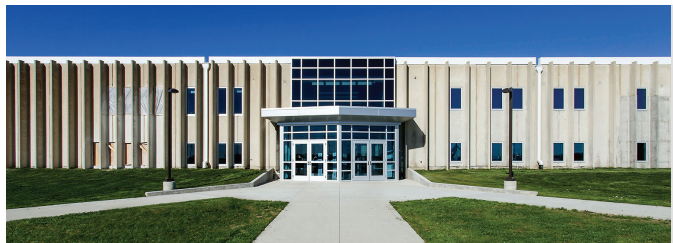
Building 430 UAV Facility Conversion, Iowa Air National Guard, Des Moines, IA • Ground source heat pump

Farris Engineering, Inc. (Farris), a 50-person mechanical and electrical consulting engineering firm established in 1967 in Omaha, NE, also has offices in Lincoln and Sidney, NE; Colorado Springs, CO; and Kansas City, MO. Designated a Total Small Business, the firm has designed projects in Nebraska, Iowa, Colorado, Kansas, South Dakota, North Dakota, Wyoming, Missouri, Oklahoma and across the country. Farris completed its first federal project more than 40 years ago, and has been prime and subconsultant on numerous Indefinite Delivery/Indefinite Quantity (IDIQ) contracts for new construction and renovation projects for the Army Corps of Engineers, Air Force, National Guard, Veterans Affairs, Indian Health Services and General Services Administration. (Please see Page 2)