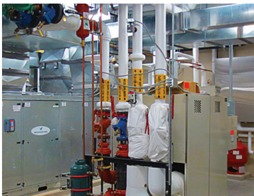
Nebraska Army National Guard Atlas Readiness Center, Mead, NE • Geothermal loopfield system