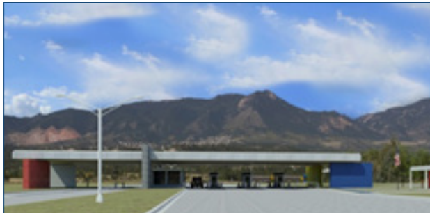
US Air Force Academy, Colorado Springs, CO • New entrance gate