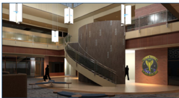
Peterson Air Force Base, RAIDRS Facility, Colorado Springs, CO • Enhanced commissioning