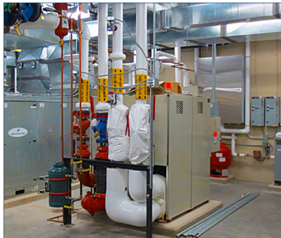
Nebraska Army National Guard Atlas Readiness Center, Mead, NE • Geothermal loopfield system