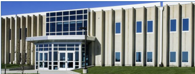
Building 430 UAV Facility Conversion, Iowa Air National Guard, Des Moines, IA • Ground source heat pump

Farris Engineering is a 60-person mechanical and electrical consulting engineering firm established in 1967 in Omaha, NE. The firm now also has offices in Lincoln and Sidney, NE, and Colorado Springs, CO; and staff in Kansas City, MO. Farris Engineering has successfully completed more than 33,000 projects in 42 states, as well as internationally.