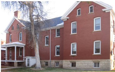
Renovate Building B3, Veterans Affairs Medical Center, Sheridan, WY • New fire sprinkler system