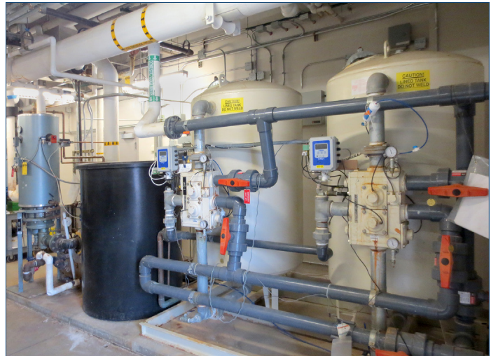
Indian Health Services, Winnebago, NE • Central utility plant conversion study